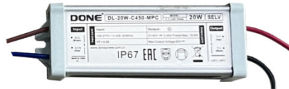
DONE brand IP67 LED Driver